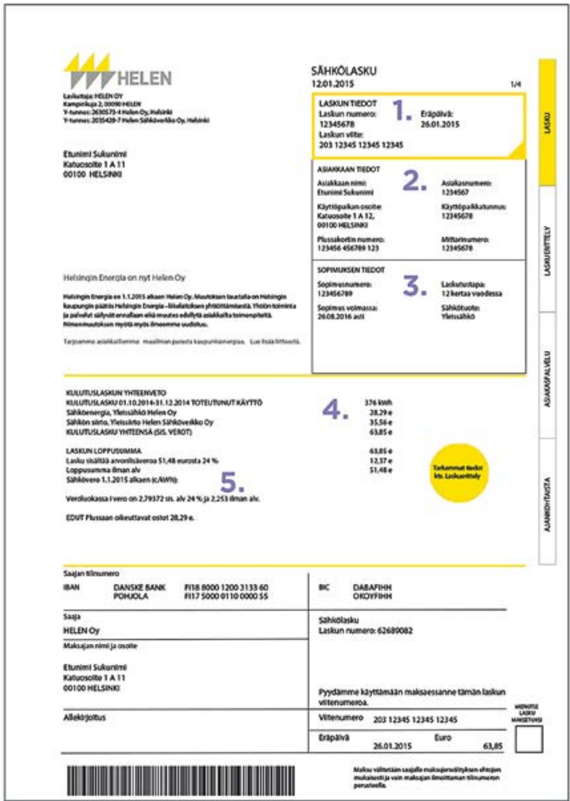
a. Find and circle the due date.